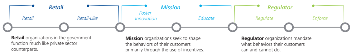
Figure 1. The retail to regulator (R2R) spectrum

Regulator organizations, as the label suggests, are focused on enforcing laws and protecting the nation. Examples include the Department of Defense, Federal Bureau of Investigation, Transportation Safety Administration, and Securities and Exchange Commission.